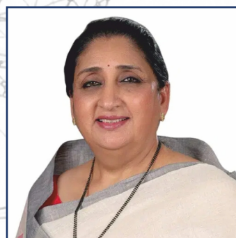
Hon. Smt. Sunetra Ajit Pawar Dy. Chief Minister, Maharashtra State