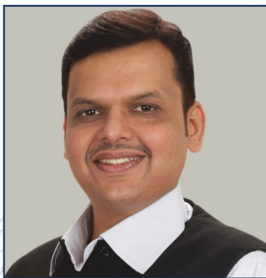
Hon. Shri. Devendra Fadnavis Chief Minister, Maharashtra State