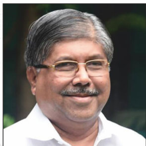
Hon. Shri. Chandrakant Patil Minister, Higher & Technical Education, Government of Maharashtra