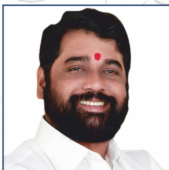
Hon. Shri. Eknath Shinde Dy. Chief Minister, Maharashtra State